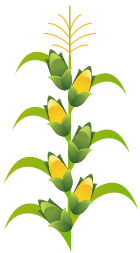
Tallo de maíz

Dibuja una línea y empareja las comidas de abajo con la fruta o vegetal que sea su ingrediente principal y más importante. ¿Sabías que algunas de tus comidas favoritas en realidad son frutas y vegetales?