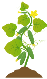
Planta de pepino