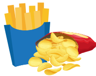
French fries & potato chips